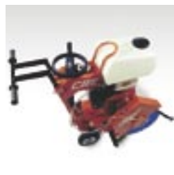
Easy blade mounting. Parking brake.