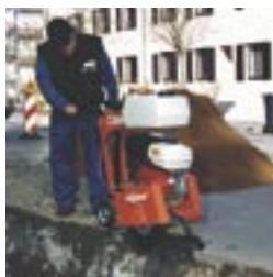
Ergonomic working condition.