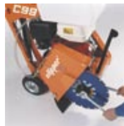
Depth gauge, lifting hook.