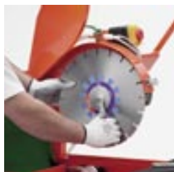
Opening cover facilitates ease of blade mounting.