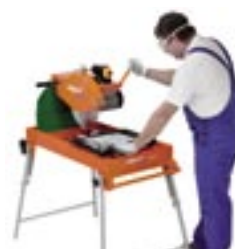
Heavy-duty conveyor cart with integrated tilting 0-45°.