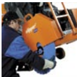
Easy access for blade changing.