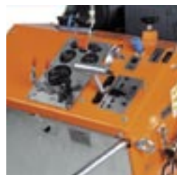
Comprehensive control panel and easy reach of operator.