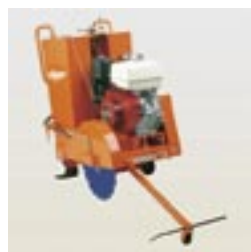
The Petrol model is equipped with a 70 litre integral water tank.