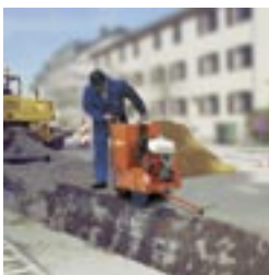
Ergonomically designed for easy operation.