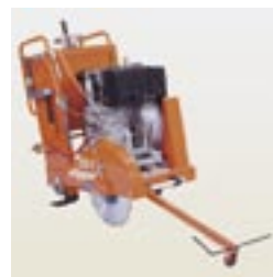
The Diesel model is equipped with a 40 litre integral water tank.