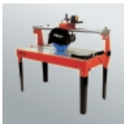
Swivel mounted cutting head. Removable handles.