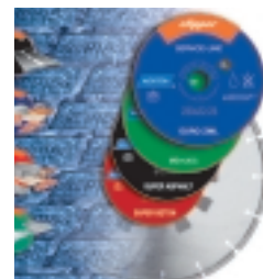
Complete and comprehensive range of diamond blades.