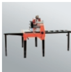
Accessories: side extension (roller), side extension (flat).