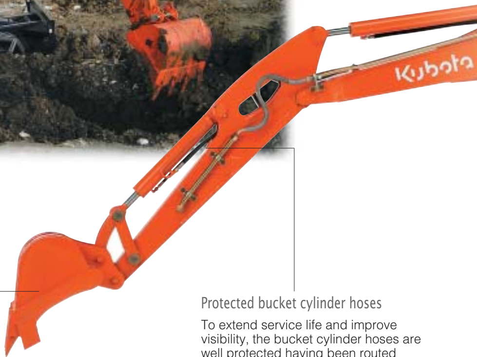
Digging arm and bucket

With the ability to deliver the most digging power, plus the efficiency of a long arm, the KX71-3 produces the largest digging depth of all long-arm mini-excavators*. Even with its long arm specification, the KX71-3 amazingly generates the biggest force for both arm and bucket digging*. Moreover, it has the ability to perform a wide range of tasks. (* In its class.)